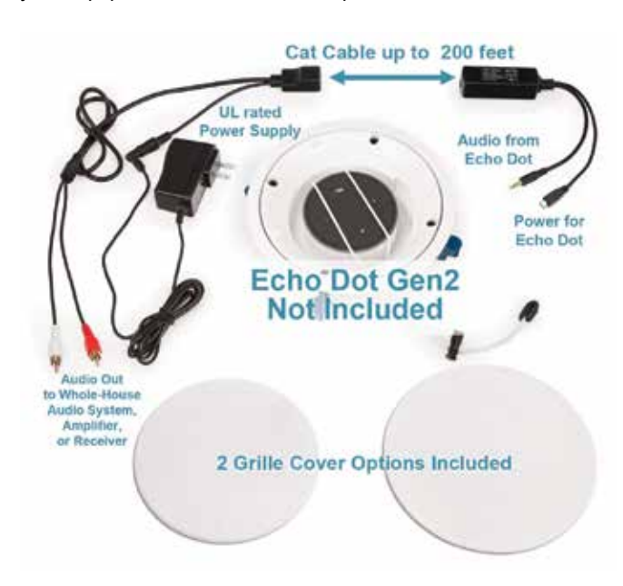
A different kit is sold separately for Echo Dot Gen 3 and Gen 4.

Our innovative solution provides all you need to install your Amazon Echo Dot (Gen 1&2) or Echo Input into the ceiling or wall of any room and extend Alexa's audio output into your own speakers. A single Cat5e (or higher) cable, sometimes referred to as ethernet or networking cable, carries both the power for the Echo device and its audio signal back to your equipment over a distance up to 200 feet.